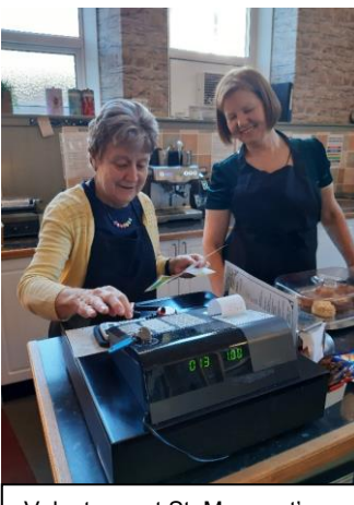
Volunteers at St. Margaret's Community Cafe

89 Durham AAP have funded a number of local mental health charities, St Margaret's Centre, RT Projects and the Waddington Street Centre have received funding to help them build their capacity and sustainability. Funding has helped St Margaret's Centre to develop their volunteer base at their community café. Overall, 25 volunteers have been supported with one of them saying, "I've wanted to volunteer in this sort of environment for a while but struggled to find a place that could accommodate my hearing impairment, it has been lovely to come to St Margaret's Centre and have people make an effort to support me so I can be independent and learn new skills."