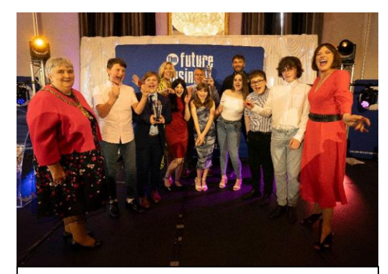
Pupils from King James I Academy celebrating success at the County Durham Future Business Magnates Competition