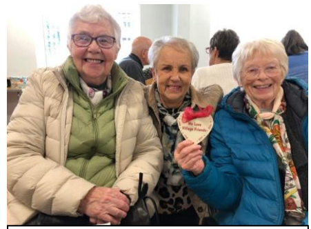
Howden-le-Wear Village Friends

months has been held as well as a social evening at The Green in Billy Row. The twenty ladies in the Connect Group have all expressed appreciation for the difference the group is making to their lives and the Men's Night in May was also highly successful.