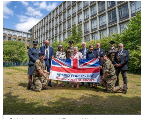
Celebrating Armed Forces Week